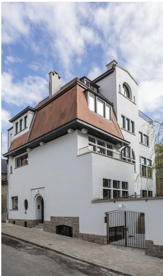
Fondation Thalie © Michel Figuet